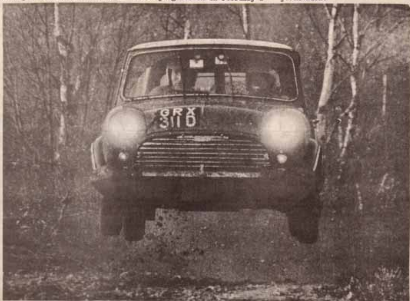
The o-o-only way to fly.... Doin' their stuff on the RAC Rallye.