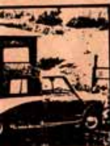
Mini van with added unit added to top as sink, stove and version cost: $140.